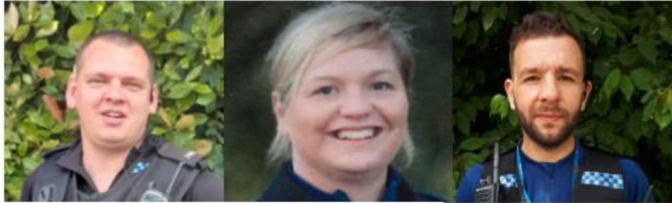
PC 21058 KITCHEN