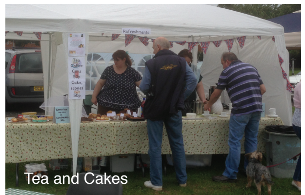
Tea and Cakes