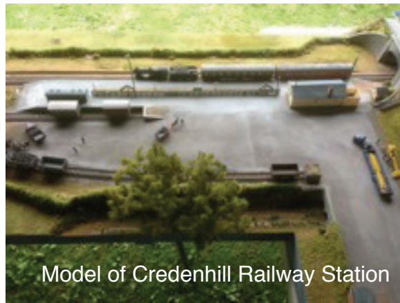
Model of Credenhill Railway Station