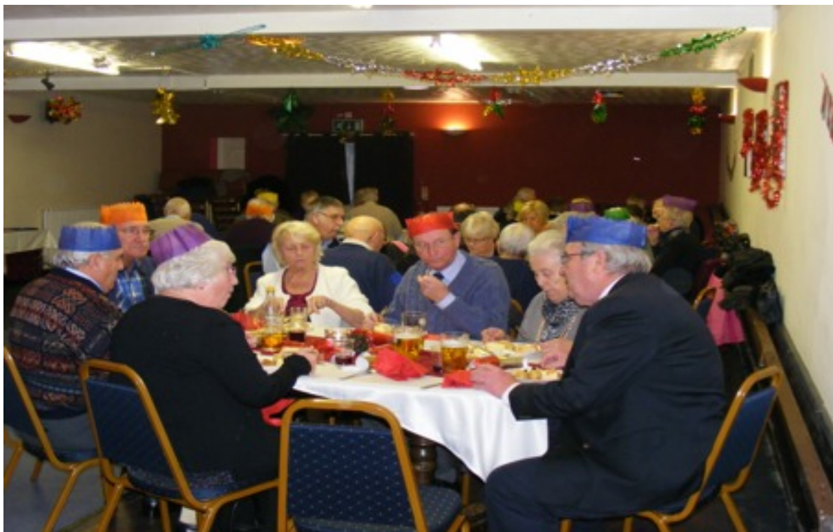
Some of our members enjoying the annual Christmas party.

2 nd , 9 th , 10 th , 23 rd 24 th February. 9 th 10 th and the 16 th March. Come and enjoy the atmosphere.