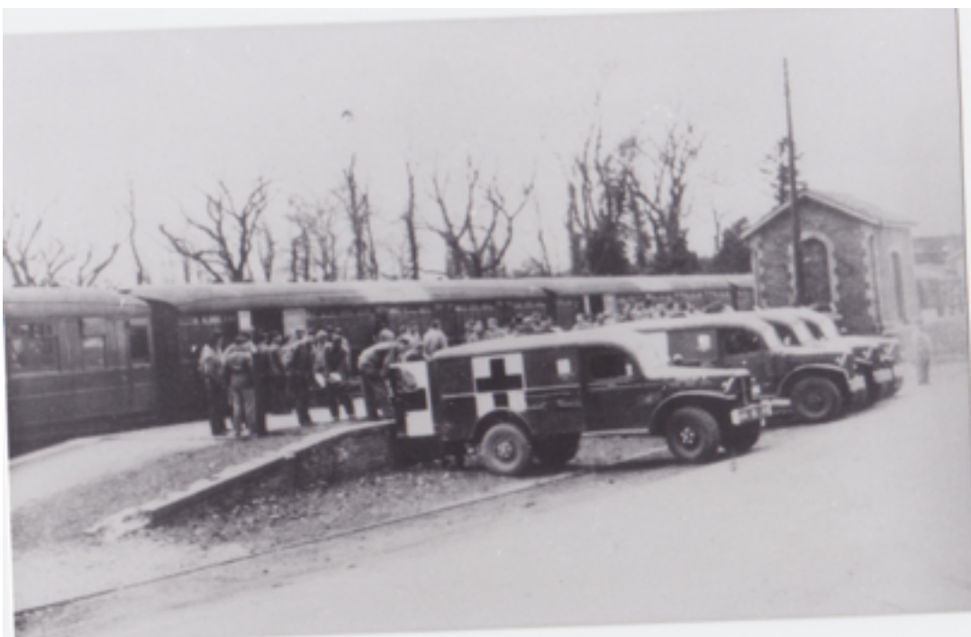
Ambulance train carrying US soldiers to Moorhampton station [Next stop from Credenhill] To be transported to the American hospital camp at Foxley [Mancel lacy].